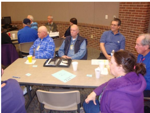
Some scenes of the Round Table Discussions