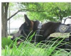
APD K9 Unit