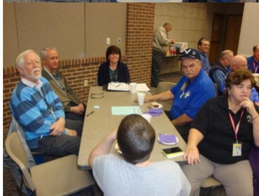
The Directors tell us about new ideas