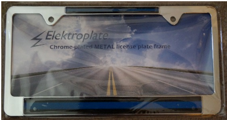
License Plate Frame