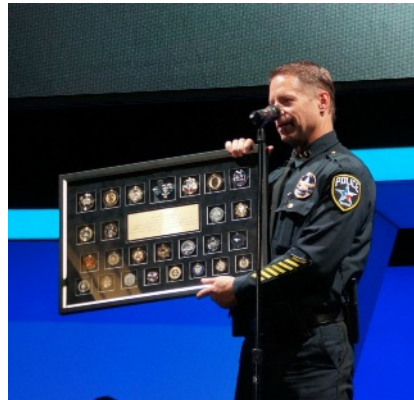
Irving Police Chief representing the North Texas Major Cities