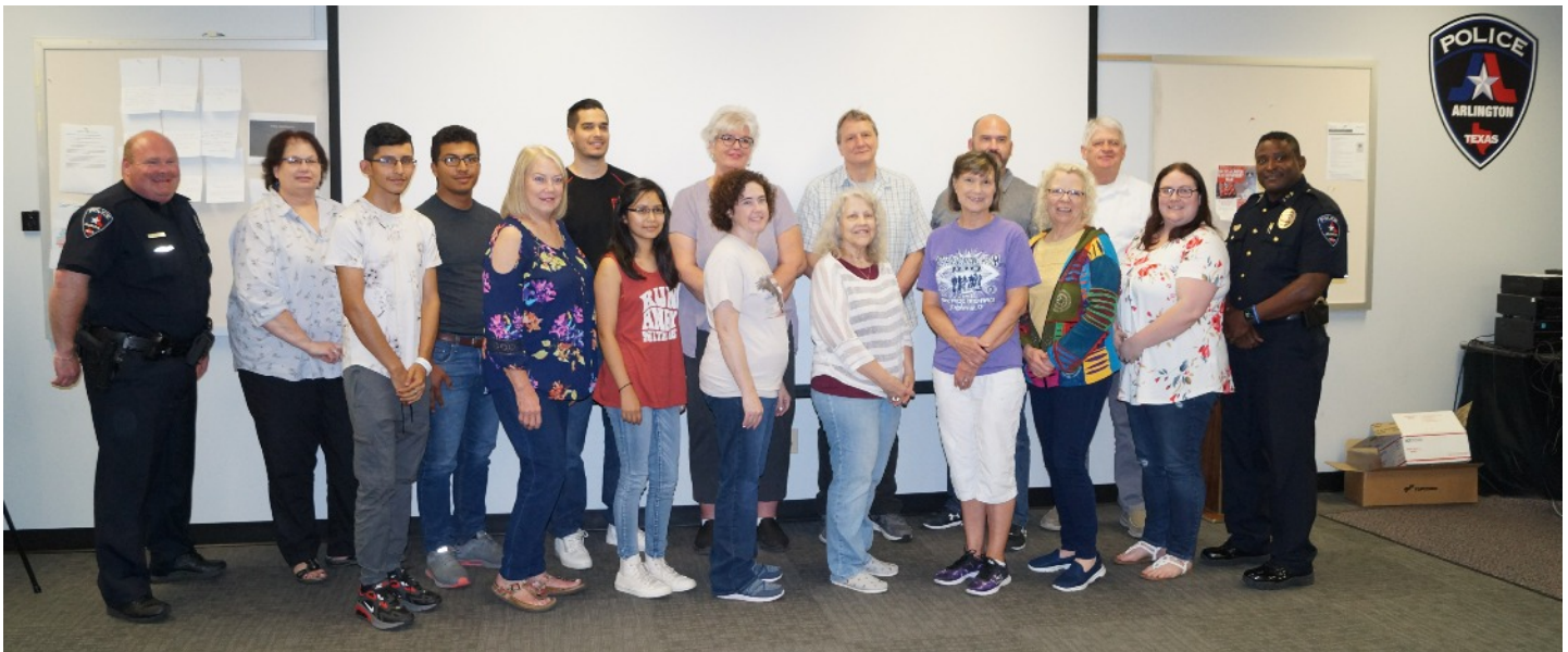
ACPA Class currently in session Prospective New Members for the Alumni Association