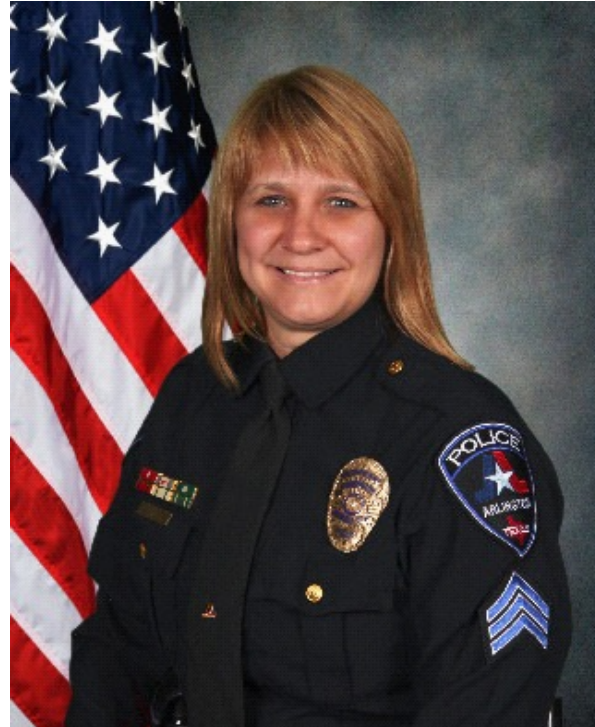
Speaker at August meeting

Membership Meeting 7:00 PM Thursday August 12, 2021 West Station