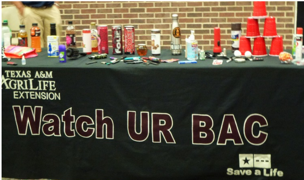
Display of containers used to hide items